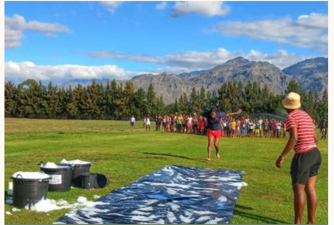
SLIP AND SLIDE FUN!