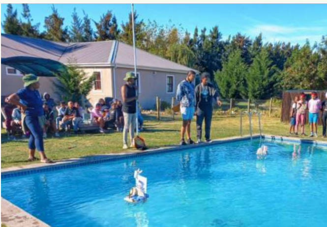
BOAT BUILDING AND RACING