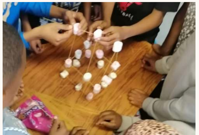
MARSHMALLOW TOWER BUILDING