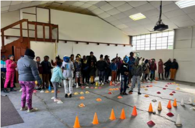
TOXIC WASTE OBSTACLE COURSE - RAINY DAY EDITION